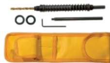
ARBOR HOLE SAW ADAPTER FOR ALL HOLE CUTTER MODELS