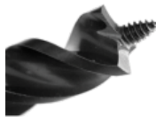
TRI-CUT AUGER BITS