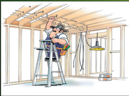
A NEW WAY!

This easy-to-hang wire dispenser allows for fast, twist-free NMSC, MC cable or Flex pulling.