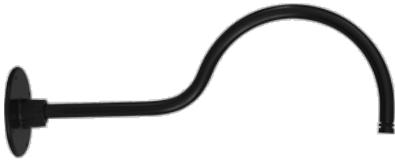
Gooseneck mount for LED Wall pack