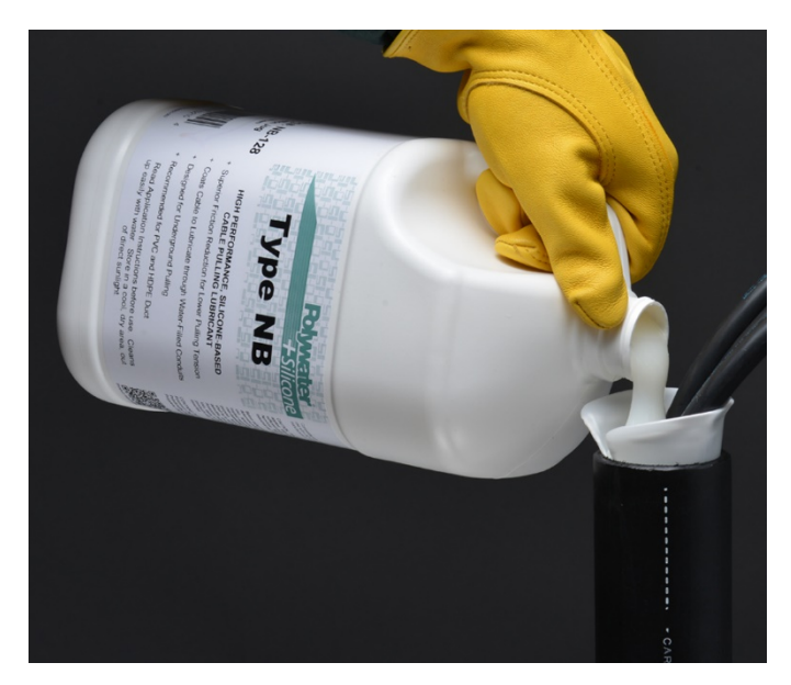
Polywater + Silicone lubricant is easy to pump or pour into conduit

Coefficient of friction data on additional or specific cable jackets or conduits can be obtained from American Polywater Corporation.