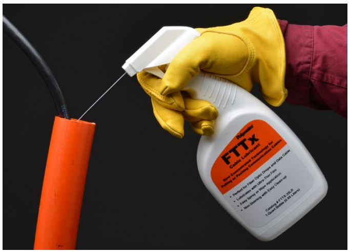
Polywater FTTx can be sprayed into small conduits

Meets MS-5/20xx Model Specification for HDPE Solid Wall Conduit for Power and Communications Applications.