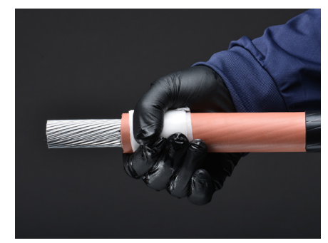
Cable prep using the DT-69