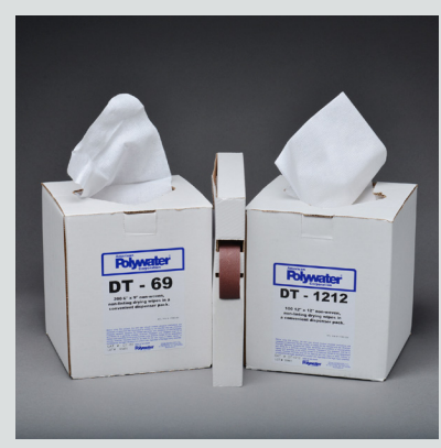
Packages designed for mobility