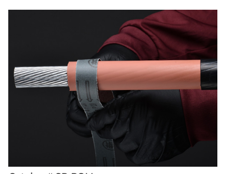
Catalog # SP-ROLL

SpliceMaster® 120-grit, non-conductive, aluminum oxide sandpaper rolls (SP-ROLL) are used to remove semi-con shield residue and jacket polymers from cable insulation during splicing. SpliceMaster non-linting towels (DT-69 & DT-1212) contain no fiber binding adhesives and won't leave a residue.