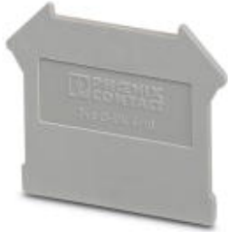
End cover, Length: 42.5 mm, Width: 1.8 mm, Height: 35.9 mm, Color: gray

Please be informed that the data shown in this PDF Document is generated from our Online Catalog. Please find the complete data in the user's documentation. Our General Terms of Use for Downloads are valid ( http://phoenixcontact.com/download )