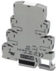
Power terminal block, for the input of up to four potentials, for mounting on NS 35/7.5

Please be informed that the data shown in this PDF Document is generated from our Online Catalog. Please find the complete data in the user's documentation. Our General Terms of Use for Downloads are valid ( http://phoenixcontact.com/download )