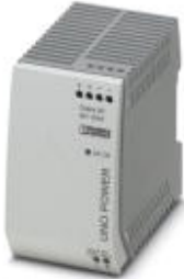
Primary-switched UNO POWER power supply for DIN rail mounting, input: 1-phase, output: 24 V DC/100 W

Please be informed that the data shown in this PDF Document is generated from our Online Catalog. Please find the complete data in the user's documentation. Our General Terms of Use for Downloads are valid ( http://phoenixcontact.com/download )