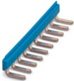
Insertion bridge, Number of positions: 10, Color: blue

Please be informed that the data shown in this PDF Document is generated from our Online Catalog. Please find the complete data in the user's documentation. Our General Terms of Use for Downloads are valid ( http://phoenixcontact.com/download )