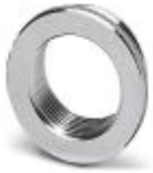
Step-down adapter, M20 to M16, including O-ring

Reducing adapter - REDUC-M-KV-M20/M16 - 1647611