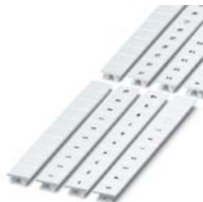
Zack marker strip, 10-section, vertically labeled with the consecutive numbers: 21 ... 30, white

Please be informed that the data shown in this PDF Document is generated from our Online Catalog. Please find the complete data in the user's documentation. Our General Terms of Use for Downloads are valid ( http://phoenixcontact.com/download )