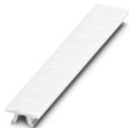
Zack marker strip, 10-section, vertically labeled with the consecutive numbers: 51 ... 60, white, width: 6 mm

Please be informed that the data shown in this PDF Document is generated from our Online Catalog. Please find the complete data in the user's documentation. Our General Terms of Use for Downloads are valid ( http://phoenixcontact.com/download )