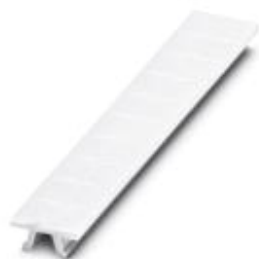
Zack marker strip, 10-section, vertically labeled with the consecutive numbers: 11 ... 20, white, width: 6 mm

Please be informed that the data shown in this PDF Document is generated from our Online Catalog. Please find the complete data in the user's documentation. Our General Terms of Use for Downloads are valid ( http://phoenixcontact.com/download )