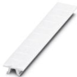
Zack marker strip, 10-section, horizontally labeled with the consecutive numbers: 81 ... 90, white, width: 6 mm

Please be informed that the data shown in this PDF Document is generated from our Online Catalog. Please find the complete data in the user's documentation. Our General Terms of Use for Downloads are valid ( http://phoenixcontact.com/download )