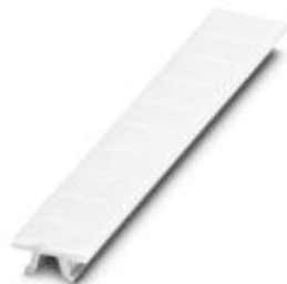
Zack marker strip, 10-section, horizontally labeled with the consecutive numbers: 41 ... 50, white, width: 6 mm

Please be informed that the data shown in this PDF Document is generated from our Online Catalog. Please find the complete data in the user's documentation. Our General Terms of Use for Downloads are valid ( http://phoenixcontact.com/download )