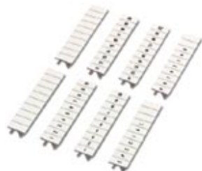
Zack marker strip, 10-section, vertically labeled with the consecutive numbers: 21 ... 30, white, Width: 5 mm

Please be informed that the data shown in this PDF Document is generated from our Online Catalog. Please find the complete data in the user's documentation. Our General Terms of Use for Downloads are valid ( http://phoenixcontact.com/download )