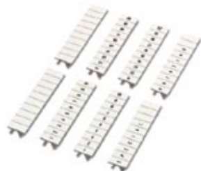
Zack marker strip, 10-section, vertically labeled with the consecutive numbers: 1 ... 10, white, Width: 5 mm

Please be informed that the data shown in this PDF Document is generated from our Online Catalog. Please find the complete data in the user's documentation. Our General Terms of Use for Downloads are valid ( http://phoenixcontact.com/download )