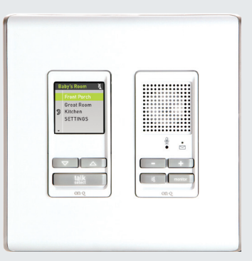
Intercom Room Unit (IC5000-XX)

Built on Cat 5 cabling, the Selective Call System includes convenient RJ45 connections and system auto-discovery.