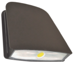
71321/71322 (22W & 40W)