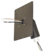
71396 1/2" Knuckle