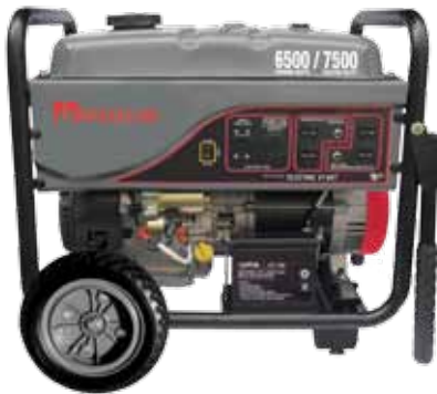
6500W | MPG6500E