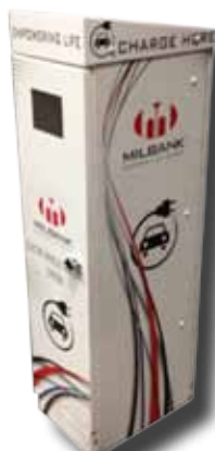
Custom design pedestal