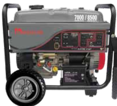
7000W | MPG70002E