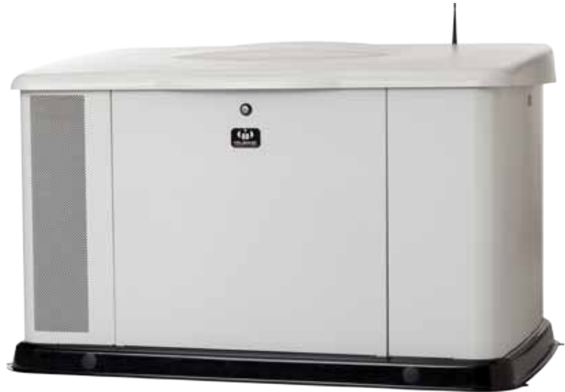
Ideal for medium- to large-sized homes

Innovative and intelligent, the 17 1 & 20kW 1 deliver the high performance homeowners expect. The unique airflow technology coupled with sound-dampening compressed fiberglass make these some of the quietest generators in the industry, a diplomatic choice to keep neighbors happy.