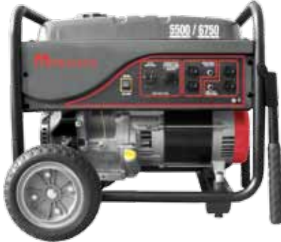
5500W | MPG55003