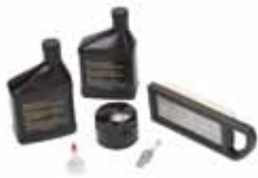
7kW Series Model MG070022

Includes special UL air filter, pre-cleaner, spark plugs, oil filter and synthetic oil.