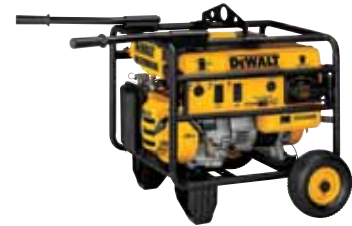
Model DG4400B – 49-state compliant DG4400BC – California compliant