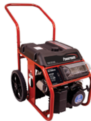
Model PM0675700 – Manual Start