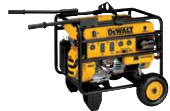
Model DG6300B – 49-state compliant