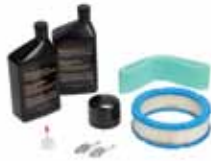
10-12kW Series Model MG101222