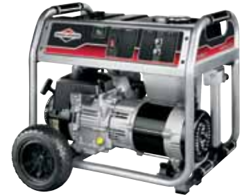
Model MGP5502 – 5,500 Watts