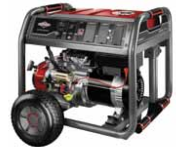
Model MGP7000 – 7,000 Watts