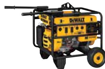
Model DG7000B – 49-state compliant

See Specifications Chart on page 31 for more information.