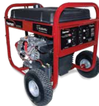
Model PM0435006 – Electric Start