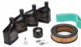
15-20kW Series Model MG151822