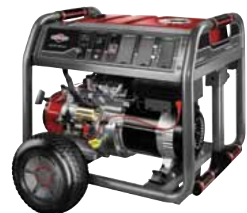
Model MGP8002 – 8,000 Watts

See Specifications Chart on page 30 for more information.