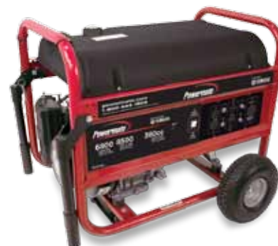
Model PM0676800 – Electric Start PM0676801 – Manual Start

See Specifications Chart on page 31 for more information.