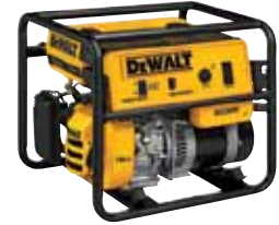
Model DG3000 – 49-state compliant DG3000C – California compliant