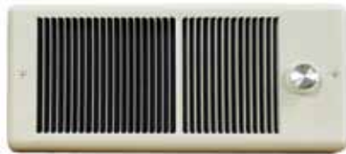
WITH IN-BUILT THERMOSTAT