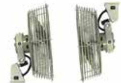
BENCH MOUNT CEILING MOUNT