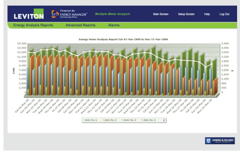
Multiple Meter Analysis Report