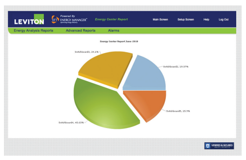
Energy Center Report