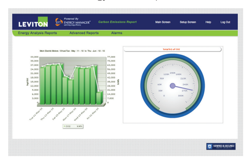
Carbon Emissions Report