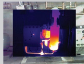
Full infrared picture-in-picture