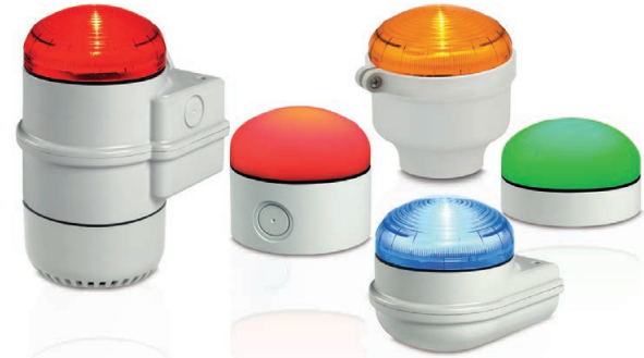
Model SLM300 and SLM350 shown with mounting base options (ordered separately)