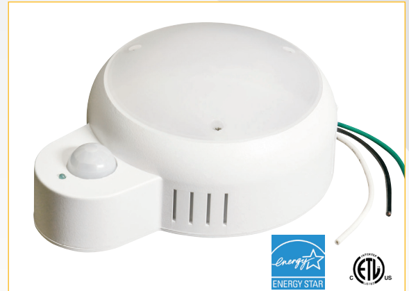
MOTION SENSING LED CLOSET LUMINAIRE