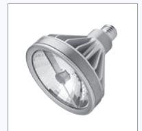
LRP SERIES LAMPS p.68 LED PAR Lamp