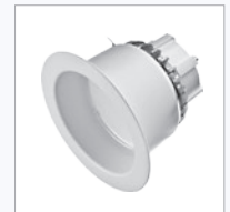
LR SERIES DOWNLIGHTS p.30 Commercial-Upgrade Downlight Solutions