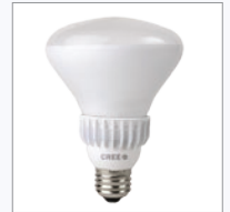
BR30 SERIES LAMPS p.76 LED Flood Lamp