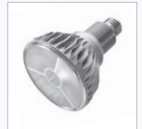
LBR SERIES LAMPS p.66 LED BR30 Lamp