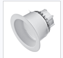
LR SERIES DOWNLIGHTS p.30 Commercial-Upgrade Downlight Solutions