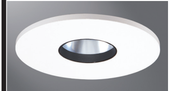
3002WHC White with Clear Reflector