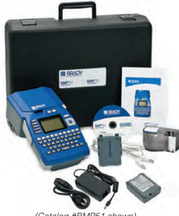
(Catalog #BMP51 shown)