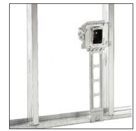
Can be used with BBFS-18 (floor stand) See page 29.

Read safety/installation instruction sheets in packages before use. These products are designed for positioning only. No load rating.