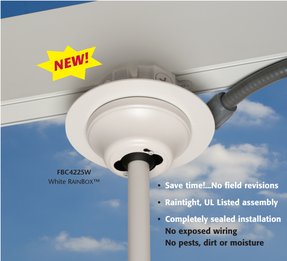
FBC4225W White RAINBOX™