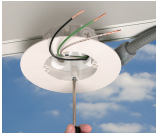
Attach medallion to box with supplied #8 x 1-1/4" screws.