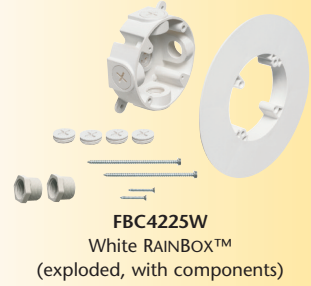
FBC4225W White RAINBOX™ (exploded, with components)