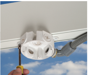
Install fitting with conduit. Seal unused openings with supplied plugs. Mount box to structural member.