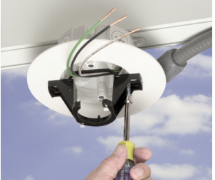
Attach fan/fixture bracket to structural member using supplied long screws (#12 x 4"). Connect wires and install fan/fixture per manufacturer's instructions.