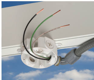
Pull wire (not included).