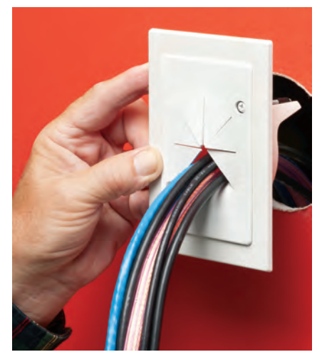
...through the slotted opening in CE1RP. Insert into hole. Level, straighten the bracket.