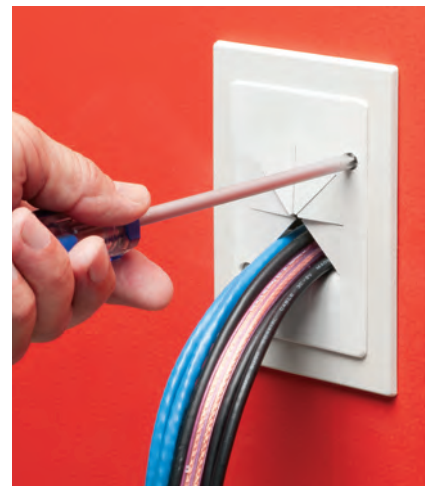
Tighten the two mounting wing screws to pull the CE1RP securely against the wall board.