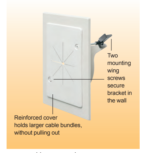
CE1RP Cable Entry Bracket