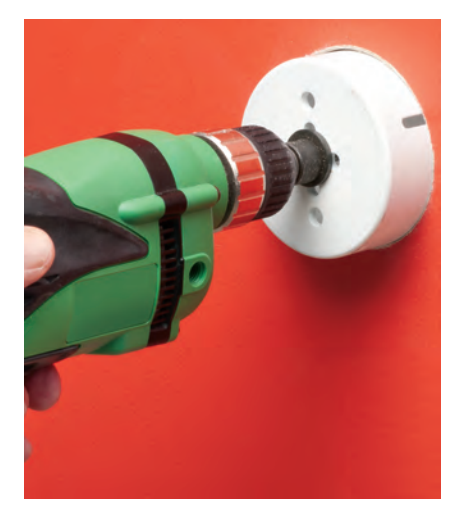
Determine bracket position. Cut opening with a 3.5" hole saw.