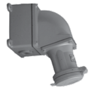
100 and 150 Amp