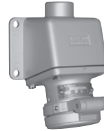
30 and 60 Amp