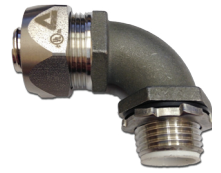
90° - NPT Thread 3/8" through 1"