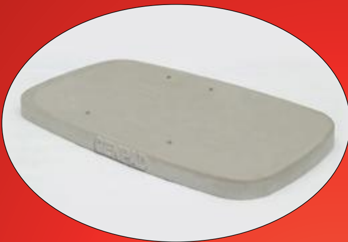
GenPad™ Designed for residential installation.