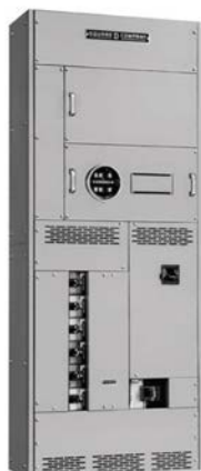
EUSERC UCT, Single Main Circuit Breaker with I-Line Distribution Panel

Visit the online FAQs page to find additional technical information covering all products including discontinued and obsolete products. https://www.schneider-electric.us/en/faqs/home/