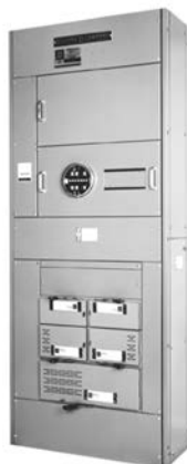
EUSERC UCT, Fusible Multiple Mains