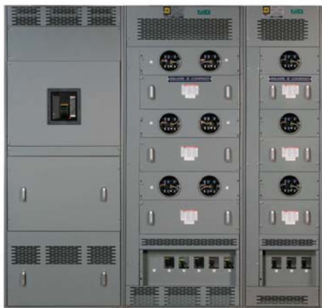
Power-Style™ Commercial Multi-Metering Switchboard Lineup