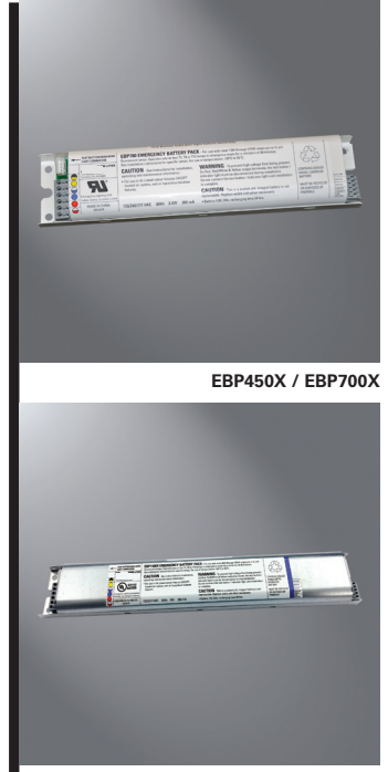
EBP450X / EBP700X