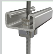
Insert Through Strut