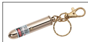
Laser tester Part Number=LASER (sold separately)