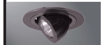
1496TBZ Tuscan Bronze Elbow