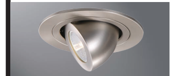
1496SN Satin Nickel Elbow