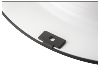
Press down color finish tabs for post-installation to create final LED 4" module.