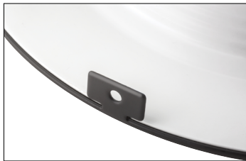
Pre-Install color finish trim insert over white 4" E Series Module.