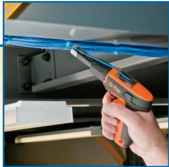
See p. C-46-C-48 for cable tie installation tools.

Ty-Rap® Detectable Cable Ties are a contamination solution for food and beverage processing plants and may aid companies in meeting the US Food and Drug Administration (FDA) Hazard Analysis of Critical Control Points (HACCP) safety standards and the European Union (EU) hygiene monitoring regulations.